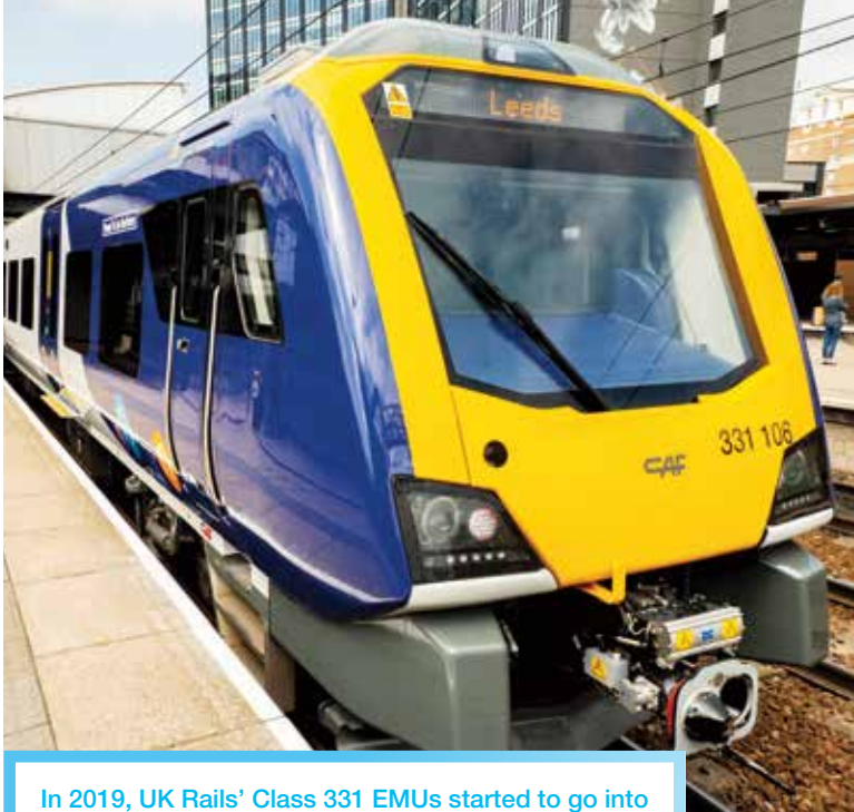
In 2019, UK Rails' Class 331 EMUs started to go into passenger service.

The new Nova 2 fleet of 60 CAF Class 397 EMU trains have started to enter passenger service in November. These Nova 2 trains run intercity services from Manchester to Scotland and Liverpool to Scotland. The new trains have more luggage space and charging points; they are also equipped with free Wi-Fi.