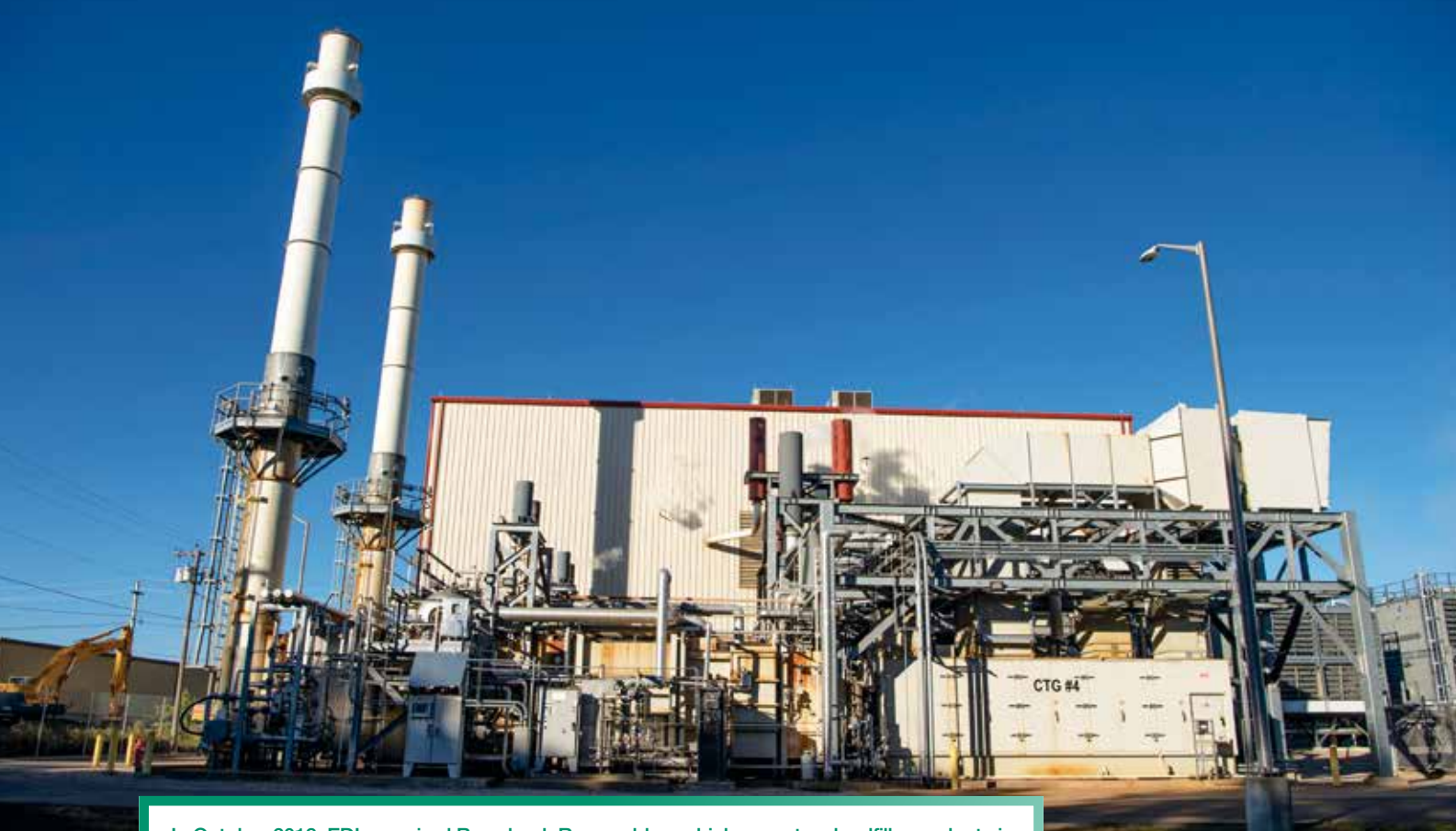
In October 2019, EDL acquired Broadrock Renewables, which owns two landfill gas plants in California and Rhode Island in the United States.