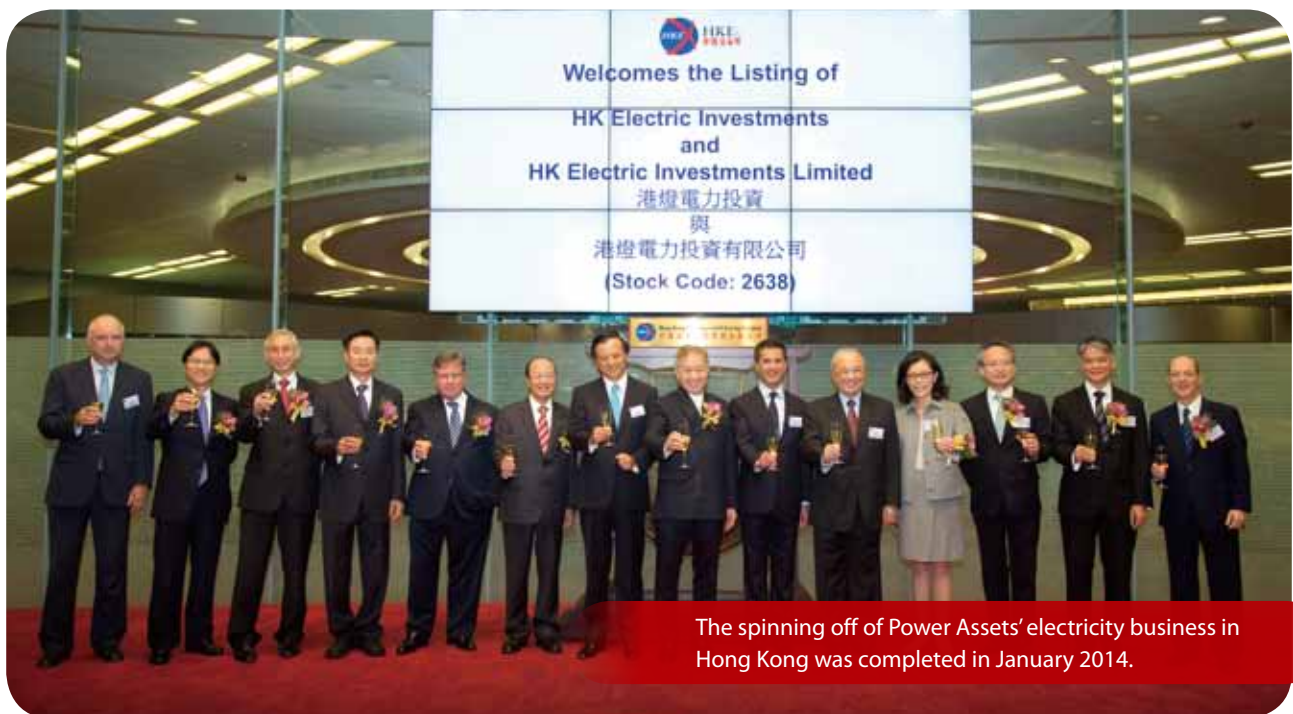
The spinning off of Power Assets' electricity business in Hong Kong was completed in January 2014.

Other investments outside of Hong Kong achieved steady performance. In New Zealand, Wellington Electricity delivered stable sales. The Thailand generation business met its production target during the year. As for power plants in Canada, revenues from the generation business were improved through steam sales and plant efficiencies. Meanwhile, the Dutch energy-from-waste business provided its first full year of profit contribution.