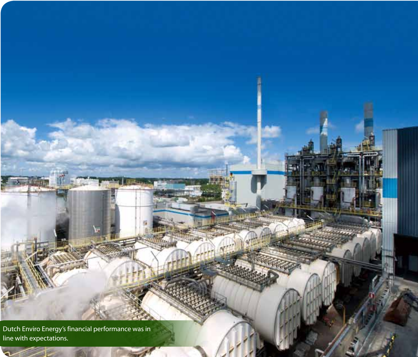
Dutch Enviro Energy's financial performance was in line with expectations.

Dutch Enviro Energy provided its first full year of profit contribution to CKI in 2014. Financial performance of the company was in line with expectations, providing stable cash returns to the Group.