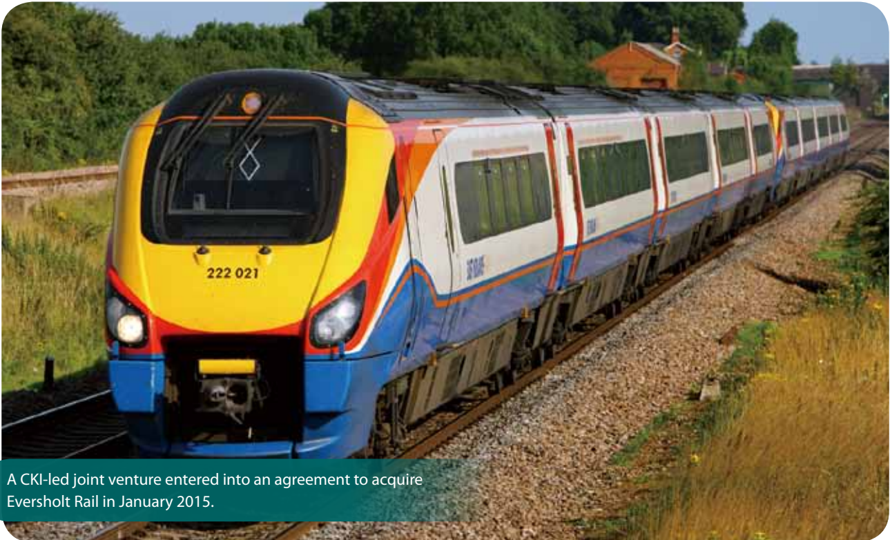
A CKI-led joint venture entered into an agreement to acquire Eversholt Rail in January 2015.