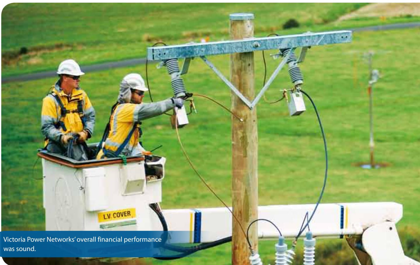
Victoria Power Networks' overall financial performance was sound.

Overall financial performance of Victoria Power Networks was sound. Key financial targets have been met or outperformed.