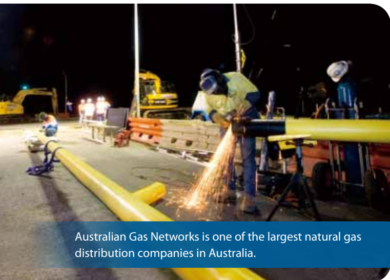
Australian Gas Networks is one of the largest natural gas distribution companies in Australia.

CKI has been a shareholder of Envestra since 1999, and has benefitted from the company’s secure and steady returns. Prior to the completion of the takeover, CKI holds a strategic shareholding of 17.46% in Envestra. The shareholding also generated a one-off gain of approximately HK$2.2 billion at completion.