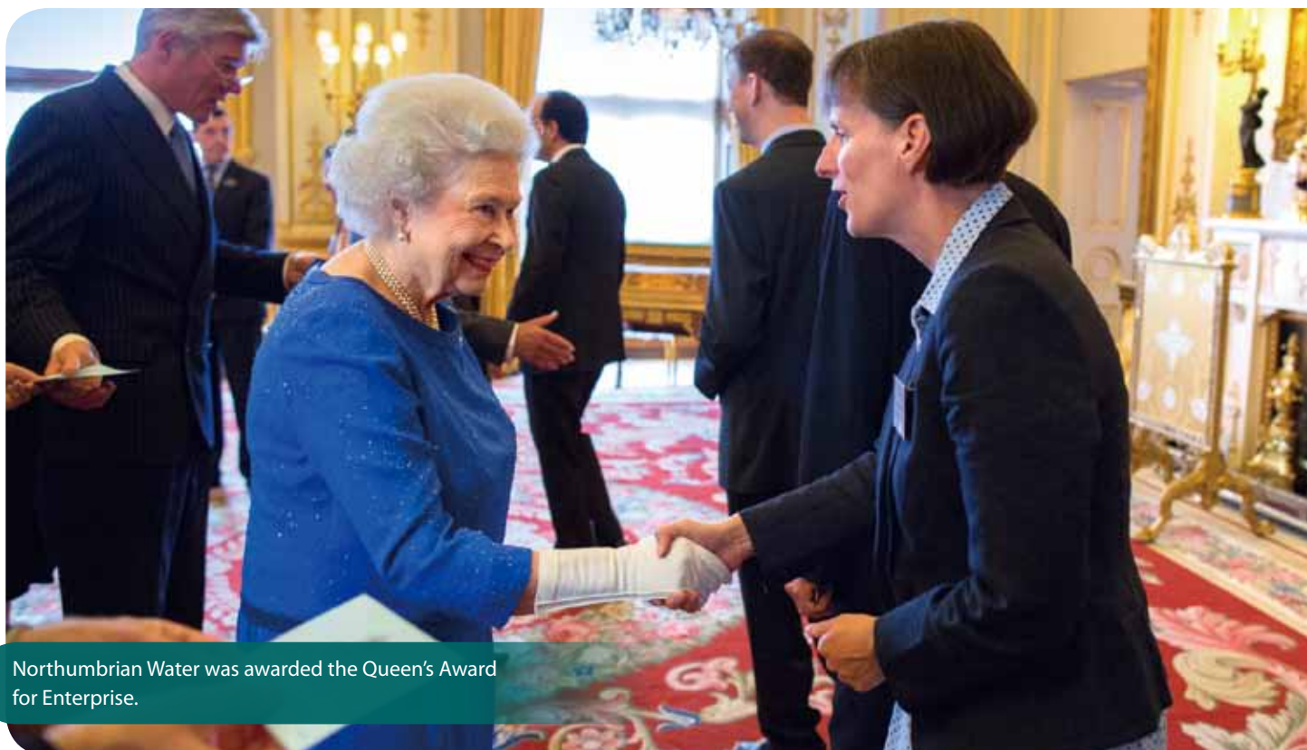
Northumbrian Water was awarded the Queen's Award for Enterprise.

Northumbrian Water also runs a range of non-regulated businesses. The company operates Kielder Reservoir, the largest man-made reservoir in northern Europe. It also owns a number of companies which have long term water and wastewater contracts in Scotland, Ireland and Gibraltar.