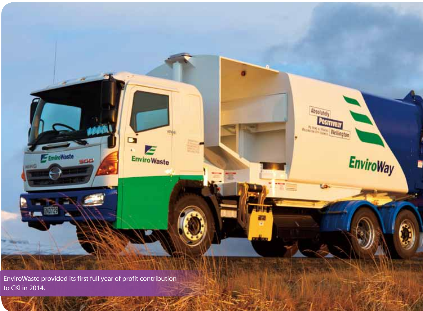
EnviroWaste provided its first full year of profit contribution to CKI in 2014.

During the year, EnviroWaste further consolidated its market presence. The company acquired the second largest waste services operator in the City of Christchurch. In addition, the company was awarded the solid waste services contracts by the city councils in the Taranaki region.