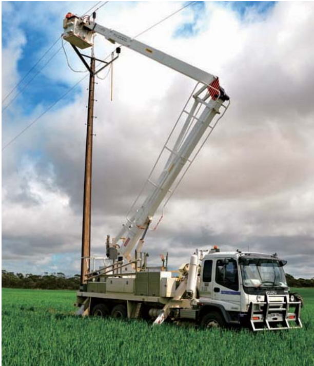
ETSA Utilities continued to meet all key financial targets.

As an industry leader in safety, ETSA Utilities' Safety Management System was certified in early 2011 to comply with Australian Standard AS 4801 and the International Standards OHSAS 18001.