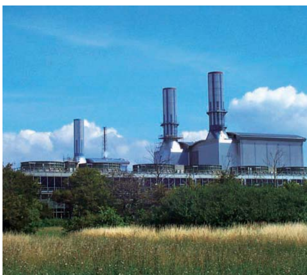
Seabank Power provided its first full year of profit contribution to CKI in 2011.

CKI holds a 25% stake in Seabank Power, while Power Assets also holds a further 25% interest. The business owns and operates a 1,140 MW combined cycle gas turbine power plant near Bristol in the United Kingdom.