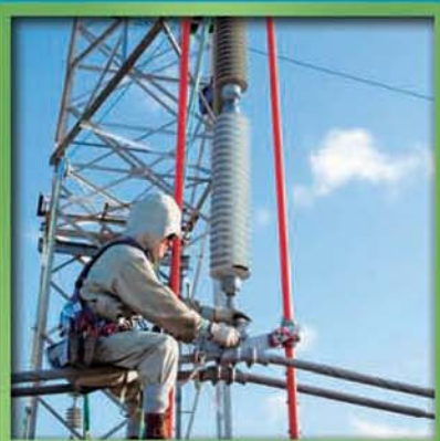
Infrastructure Investment in AUSTRALIA