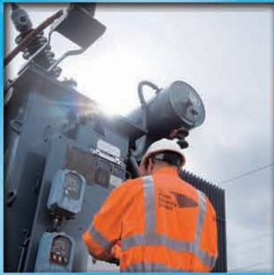
Infrastructure Investment in UNITED KINGDOM