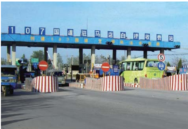
CKI's toll road and bridge investments in Mainland China achieved satisfactory performance.

CKI has a 44.2% stake in the Changsha Wujialing and Wuyilu Bridges. Growth of 5.5% was recorded in net profit for the year.