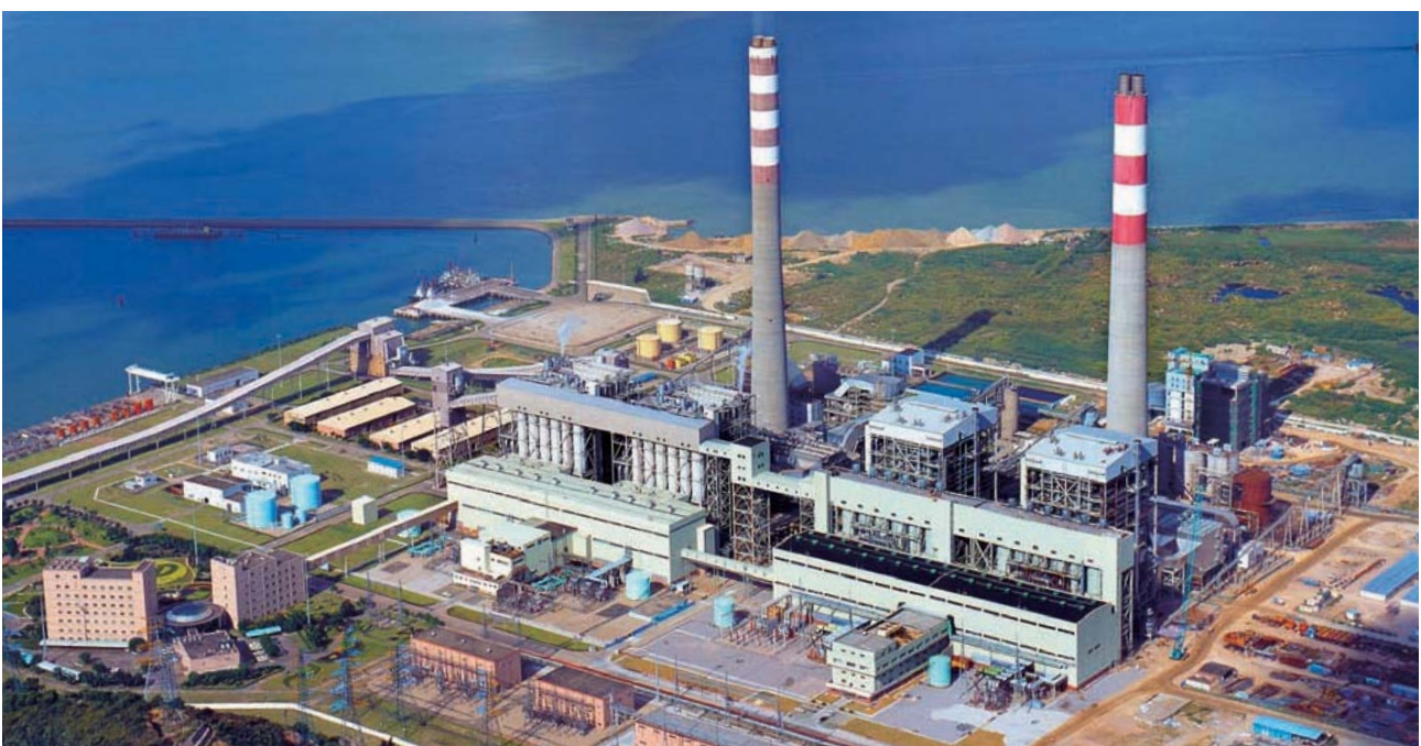
Good performance was achieved by Zhuhai Power Plant and Jinwan Power Plant.

In Thailand, the Ratchaburi Power Company Limited recorded a successful year in 2011.