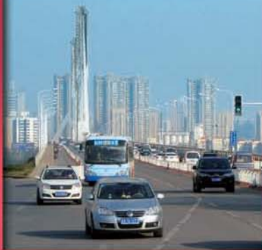
Infrastructure Investment in CHINA