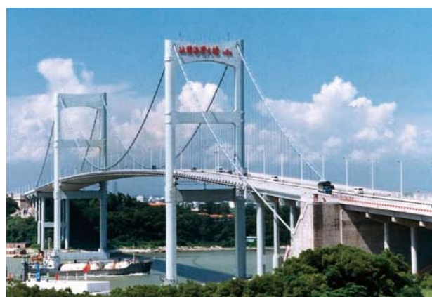
Shantou Bay Bridge recorded a 9.8% increase in toll revenue.

The Group has a 51% interest in Tangshan Tangle Road. As a result of the robust economic growth of the Tangshan area, this project achieved a strong performance in 2011 with a 42% increase in toll revenue. Net profit distributable to shareholders rose 40% accordingly.