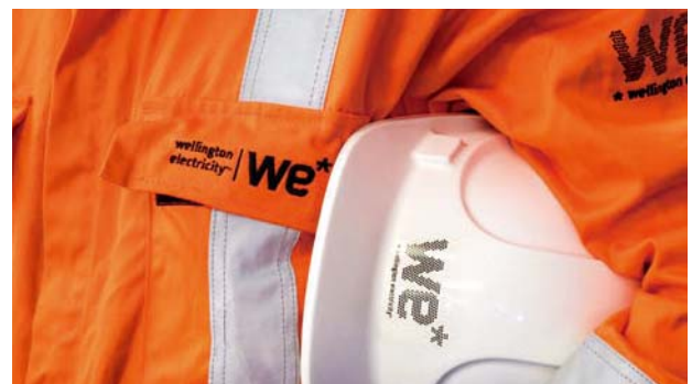
Wellington Electricity delivered a stable operating performance.

In regard to operation safety, reliability and customer service, goals were all attained. Good performance was achieved.