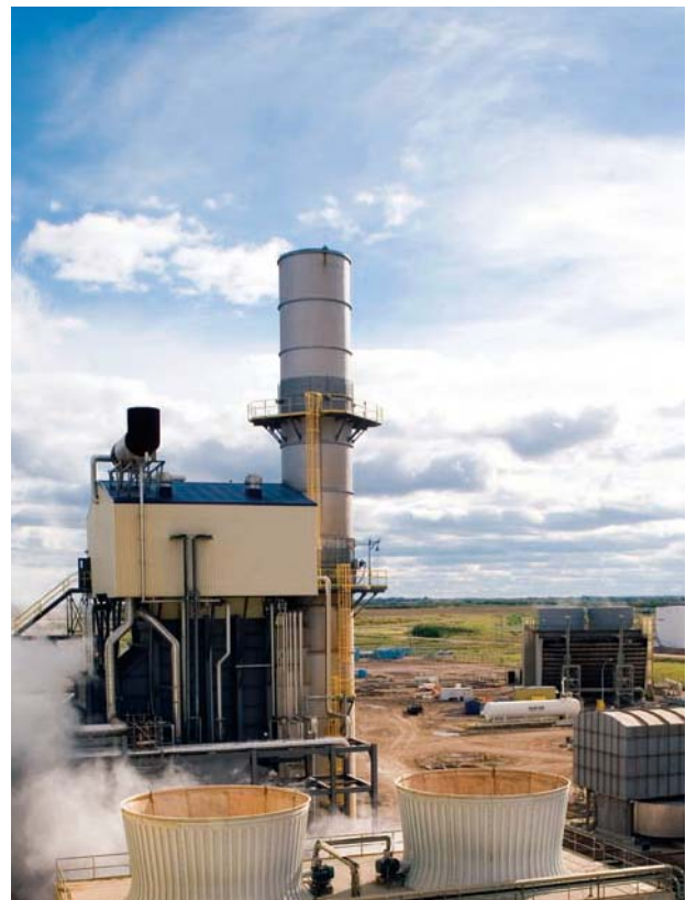
The acquisition of the Meridian Cogeneration Plant has enhanced the Group's portfolio and revenue stream in Canada.

Stanley Power owns a 49.99% interest in TransAlta Cogeneration, L.P., which has ownership stakes in five power plants, comprising four natural gas-fired cogeneration plants in Alberta and Ontario, and a coal-fired generation plant in Alberta.