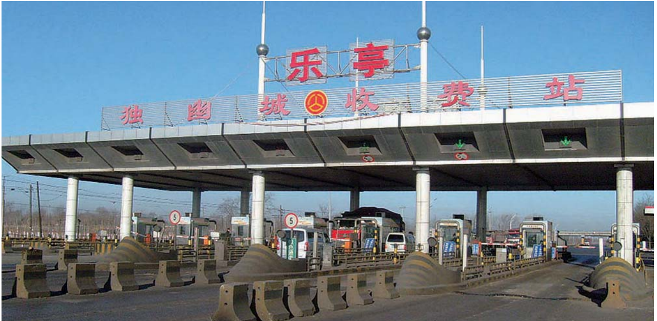
Tangshan Road achieved a strong performance in 2011 with a 42% increase in toll revenue.