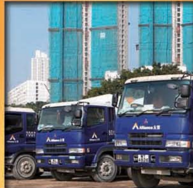
Investment in INFRASTRUCTURE RELATED BUSINESS