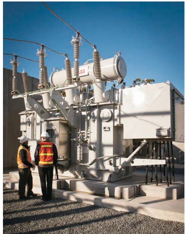
Powercor is Victoria's largest electricity distributor.

In terms of customer service, both CitiPower and Powercor performed well. The 2011 Community Reputation Index, which benchmarked the businesses against other Victorian and South Australian electricity distributors, revealed that CitiPower's community reputation index score rose by 7% in 2011. Meanwhile, Powercor enjoyed its eleventh successive years as most reputable electricity distributor, with a year-on-year rise in the index score of 2%.