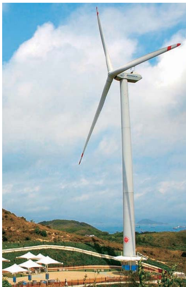
Lamma Winds generated 868 MWh of electricity in 2011.