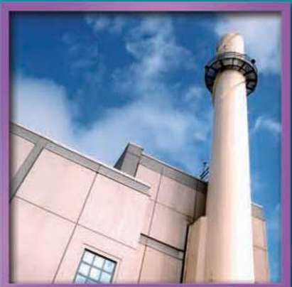
Infrastructure Investment in CANADA