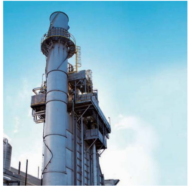
Stanley Power continued to provide CKI with reliable and secure returns.

Stanley Power delivered a satisfactory performance and continued to provide CKI with reliable and secure returns in 2011.