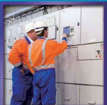
Infrastructure Investment in NEW ZEALAND