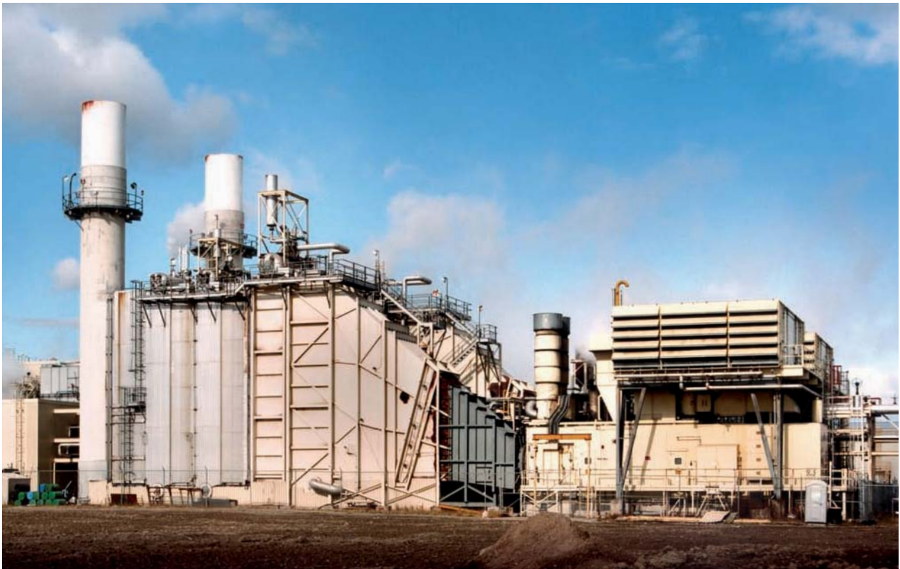
Stanley Power's portfolio is made up of six electricity generating plants in Canada with a total installed capacity of 1,362 MW.