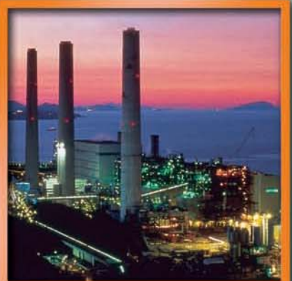
Investment in POWER ASSETS