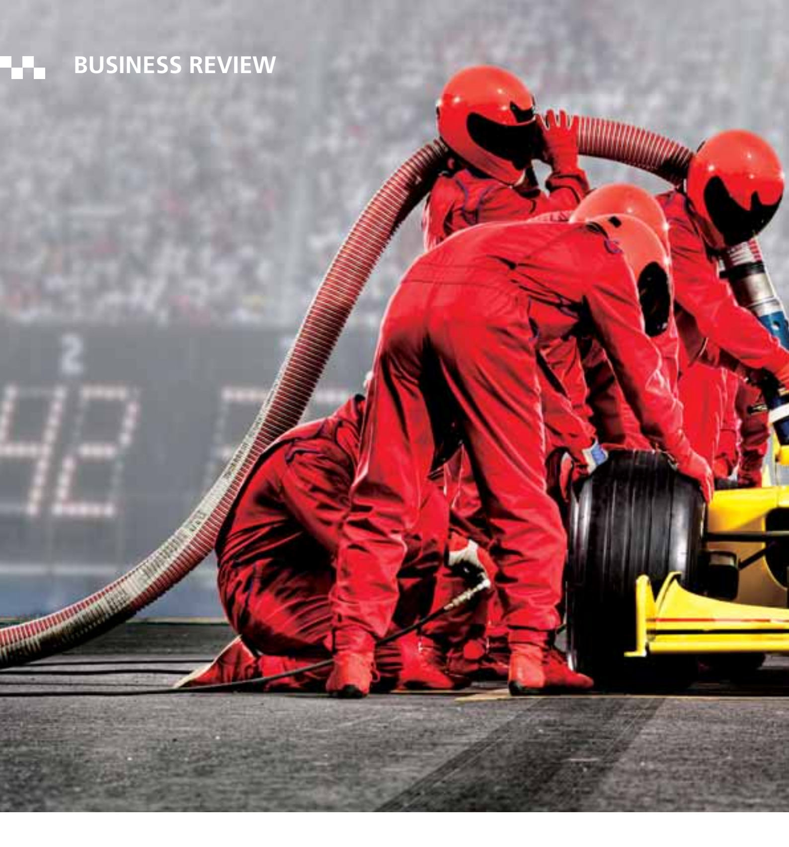
INVESTMENT IN HK ELECTRIC