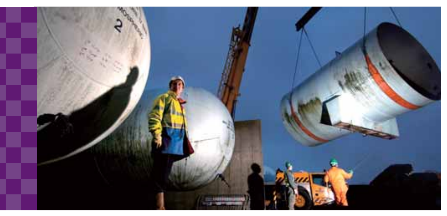
Northern Gas Networks distributes gas to approximately 2.5 million customers, comprising homes and businesses across the North of England.

In the United Kingdom, CKI has investments in both gas and water businesses. In addition to having a significant stake in Northern Gas Networks, the Group also owns Cambridge Water and holds a strategic investment in Southern Water.