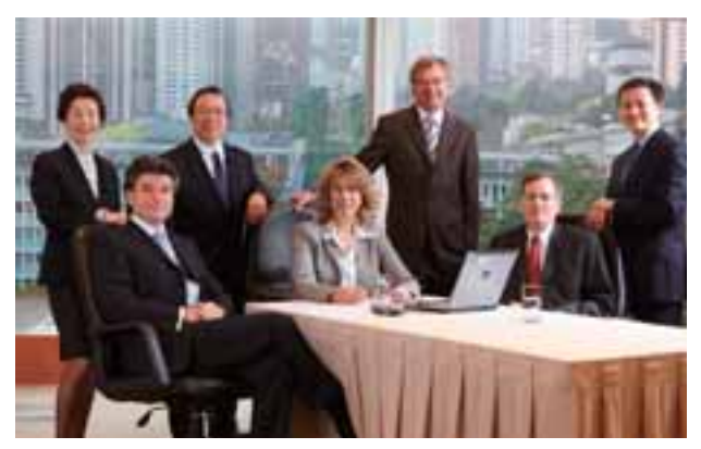
The board members and shareholder representatives of TransAlta Cogeneration oversee the overall operations of the company, which comprises six electricity generating plants in Canada.

CKI has invested in power generation in Canada through the establishment of Stanley Power, the vehicle set up to hold stakes in six electricity generating plants with a total capacity of 1,362 MW.