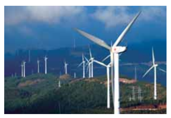
HK Electric's 48 MW wind farm in Dali, China has commenced operations in January 2009.

With regards to existing investments, the Ratchaburi Power Station in Thailand was completed in 2008, with the first unit commissioned in March and the