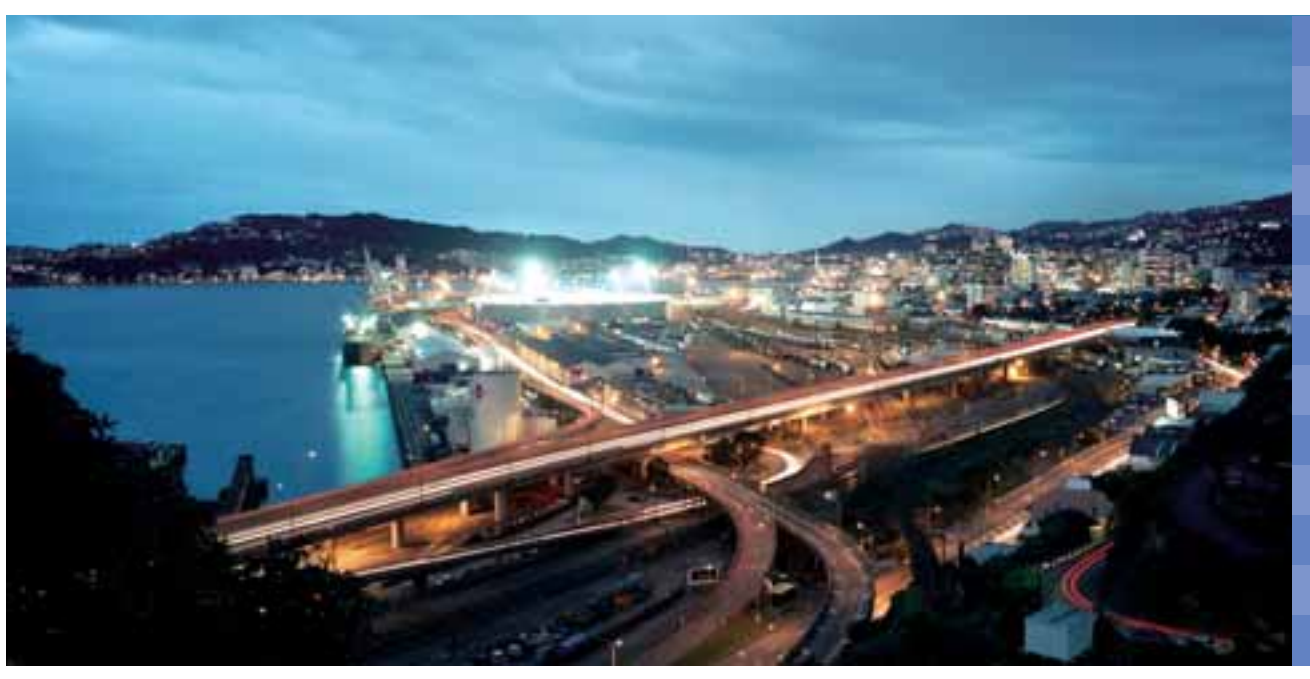
The Wellington Electricity Distribution Network supplies electricity to the city of Wellington, capital of New Zealand.

CKI has made its first foray into New Zealand through the acquisition of the Wellington Electricity Distribution Network which supplies electricity to the capital city of Wellington.