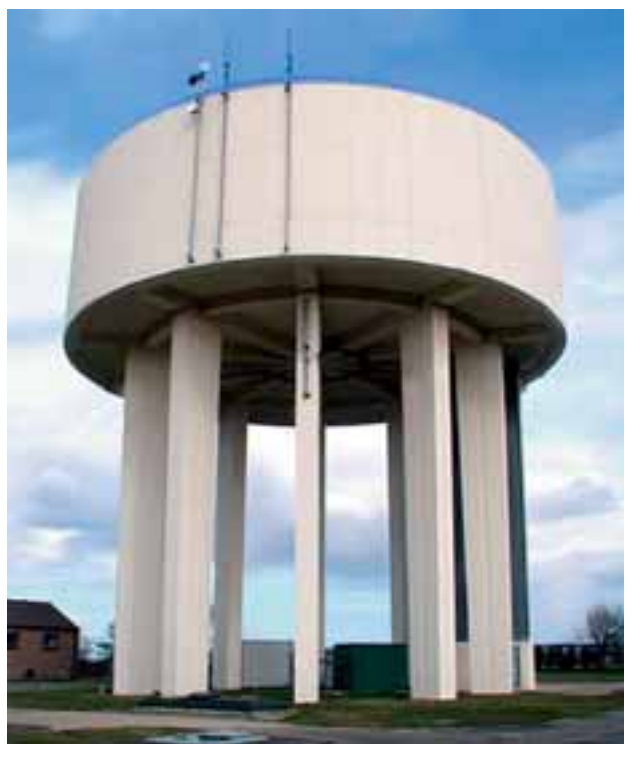
Cambridge Water serves an area that spans over 1,175 square kilometres in South Cambridgeshire in the United Kingdom.

In 2008, Cambridge Water continued to deliver stable returns to CKI, with a double-digit cash yield. It achieved an impressive, near perfect 287.0 points out of a maximum of 287.5 in the annual "Service and Delivery Report" compiled by Ofwat. This represents a second place achievement nationally. Cambridge Water also attained 100% in the stringent testing of its water quality, making it amongst the cleanest and safest water in the United Kingdom.