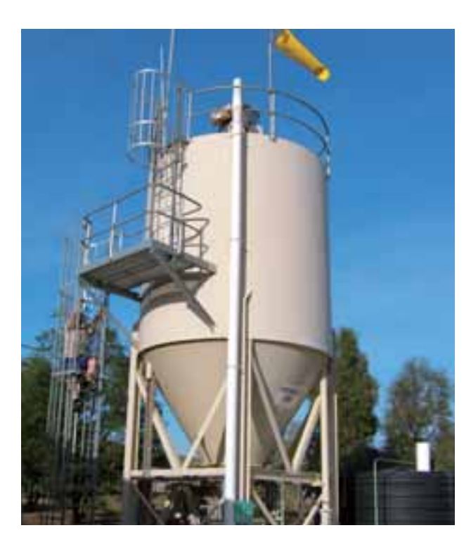
AquaTower is the exclusive potable water supplier for four regional towns in Victoria.

CitiPower supplies electricity to more than 300,000 residential and business customers in Melbourne's CBD and inner suburbs, including first-class cultural and sporting facilities such as Federation Square, the Melbourne Cricket Ground, the Victorian Arts Centre and the home of the Australian Open, Melbourne Park. A large proportion of CitiPower's electricity infrastructure is located underground, with multiple back-up and rerouting options should a fault occur somewhere along