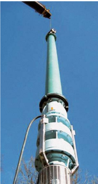
Cambridge Water supplies fresh water to customers in South Cambridgeshire, the United Kingdom.

The total volume of water delivered by the AquaTower business during 2006 was 2,795 million litres. Providing an essential resource for about 25,000 people, this asset continues to provide stable contributions to CKI.