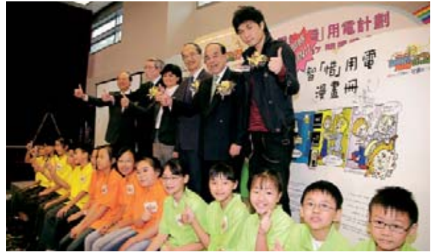
The Smart Power Campaign promotes energy efficiency and conservation.

The Australian electricity distribution businesses in South Australia and Victoria achieved good financial and operational performance in 2006, exceeding financial targets. Both revenue and demand in the businesses increased during the year.