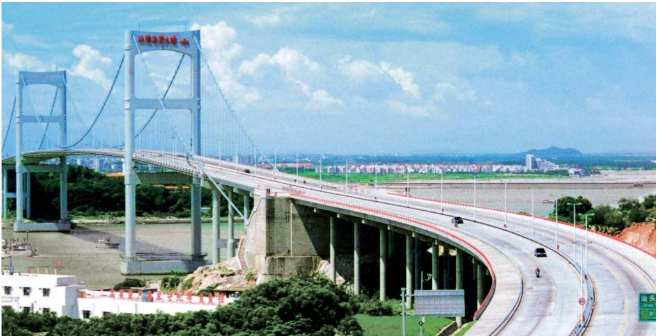
The Shantou Bay Bridge achieved double-digit growth in toll revenue during the year under review.

interest in the Lane Cove Tunnel, with the aim of maximizing shareholder value through the extraction of a premium and the retention of an upside share in the divested shareholding through a defined mechanism for revenue sharing. The Tunnel has opened in March 2007.