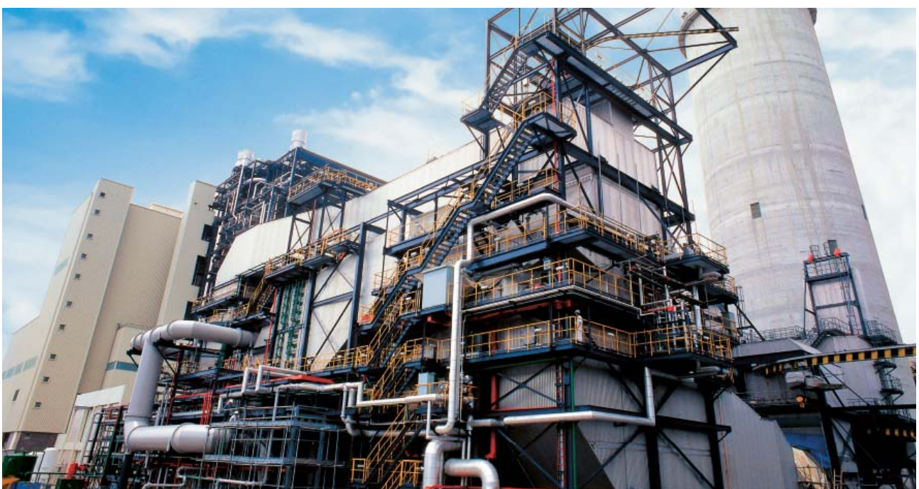
Unit 9, commissioned in October 2006, increases the generating capacity of Lamma Power Station from 3,420 MW to 3,755 MW, as well as helps to reduce emissions through the use of natural gas.

In Thailand, construction of the 1,400 MW gas fired power station in Ratchaburi province, in which Hongkong Electric has a 25% interest, is well underway and the commissioning of the power station is scheduled for 2008.