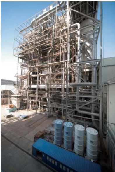
The Zhuhai Power Plant continues to be one of the most efficient, reliable and safe plants in Mainland China.

CKI also holds a 45% stake in the Siping Cogen Power Plants in Jilin, which comprise three generator sets of 200 MW in total capacity. In 2006, the plant generated over 1.2 billion kW of electricity and 2.45 million GJ of heat, breaking the previous records set in 2005. With the completion of the third boiler in December 2006, it is expected that even more reliable power and heat will be supplied to the Jilin power grid and Siping City. In spite of the increasing price pressure on coal, overall operating costs were reduced and pleasing returns were achieved for CKI.