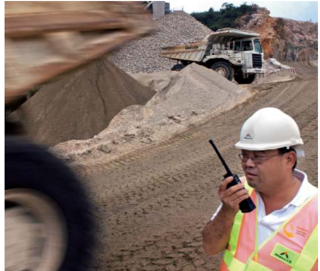
Alliance's Lam Tei quarry contract was extended until 2015, strengthening its position in the domestic aggregates business.

Green Island International has continued to study the feasibility of commercializing its “co-combustion” technology, an innovative thermal treatment for waste that has been developed in Hong Kong in partnership with the Hong Kong University of Science and Technology.