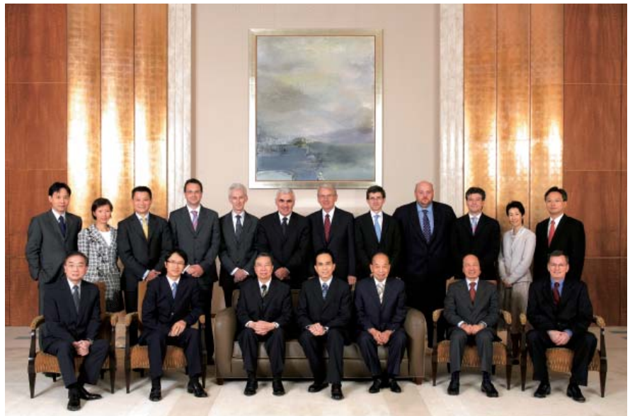
Northern Gas Networks reported its first full year of profit contribution to CKI in 2006.

The period under review represents the first full year of profit contribution for this business in which CKI holds a 40% stake. Despite warm weather during the latter part of the year, Northern Gas Networks delivered a very satisfactory performance and achieved double-digit cash yields for CKI.