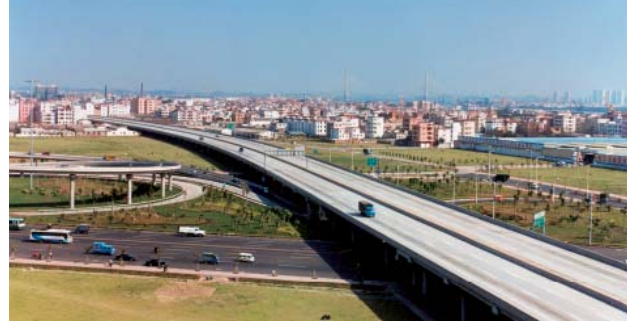
The Guangzhou East-South-West Ring Road achieved a satisfactory performance, with increases in traffic flow and toll revenue.

CKI holds a 40% stake in the consortium selected to build and operate the Lane Cove Tunnel for 33 years. The Group is now in the process of divesting 21% of its