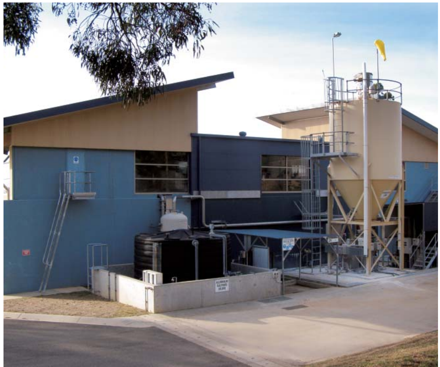
AquaTower is the exclusive potable water supplier of four regional towns in Victoria, Australia.