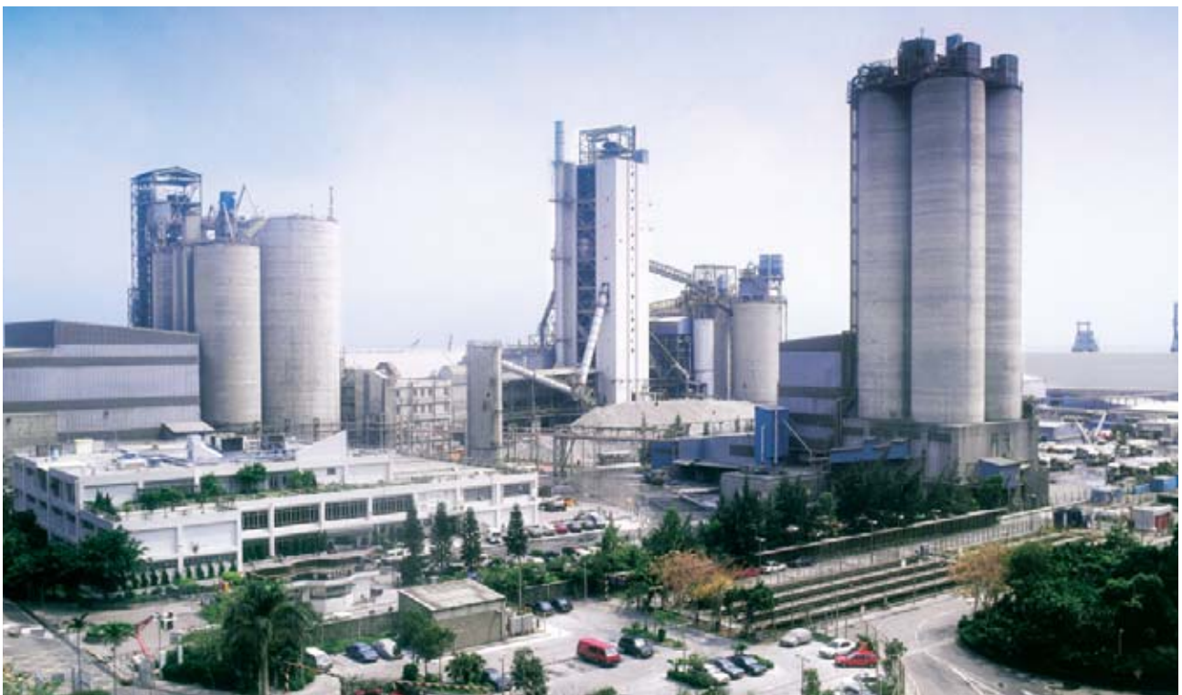
Green Island Cement achieved a smooth operational performance during the year.