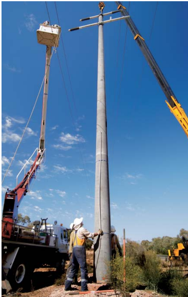
Powercor services over 660,000 customers in central and western Victoria, as well as Melbourne's outer western suburbs.