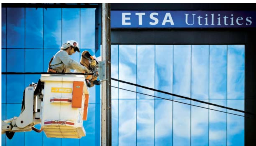
ETSA Utilities is the primary electricity distribution business for the state of South Australia.

CKI holds a 16.4% stake in Envestra that has been generating double-digit cash yields consistently since 1999.