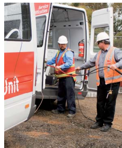
CitiPower's network covers 157 square kilometres, encompassing Melbourne's central business district and inner suburbs.