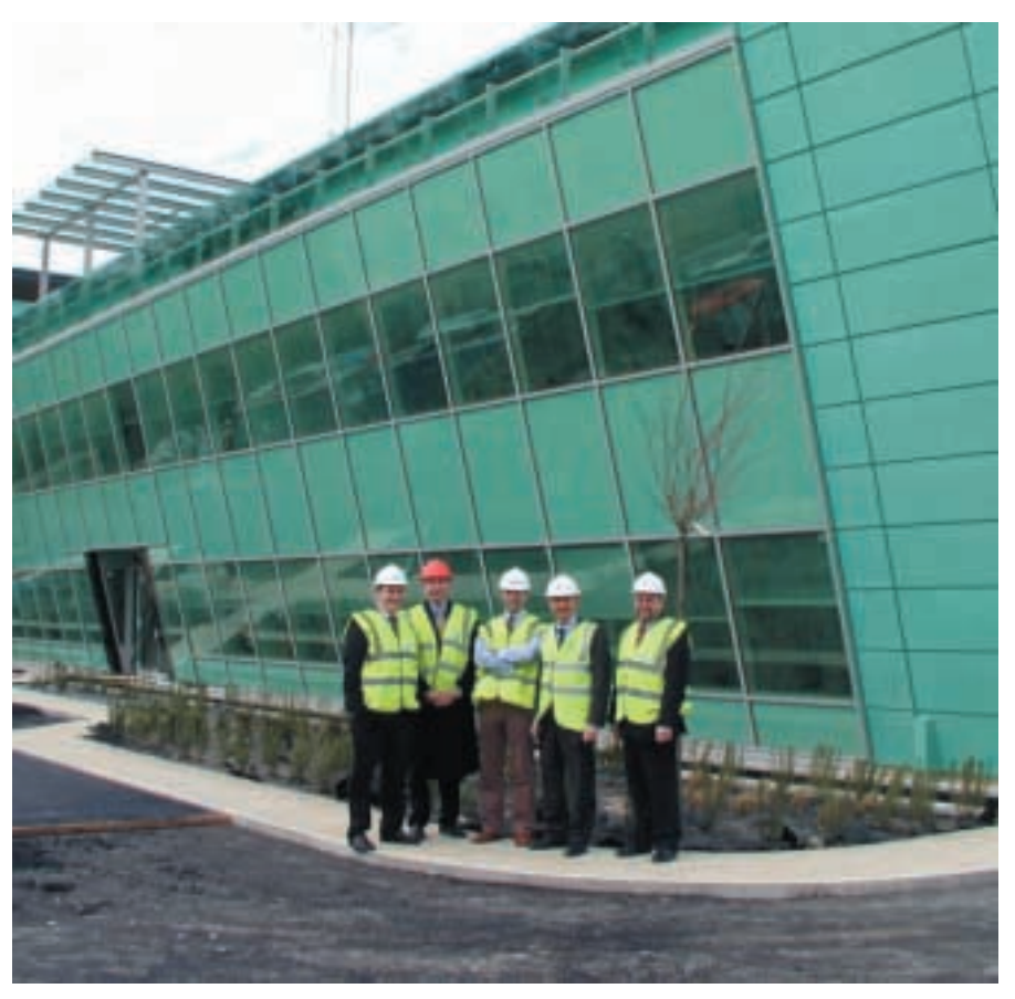
Cambridge Water serves approximately 300,000 people in South Cambridgeshire with highly efficient water services.

CKI is interested in investing in low risk regulated assets with steady and solid returns. In addition to strengthening our operations in existing markets, we are keen to explore other new markets around the world. CKI is a key player in global infrastructure industries and we will pursue new investment opportunities with vigour. We hope to expand our market penetration and geographical reach through more sound investments.